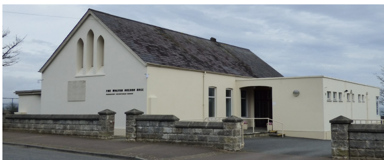
The Walter Nelson Hall showing some of the extensions to the school building

When, in turn, the second school closed in 1962, a new all purpose modern Primary School, being built on Springwell Drive by the Down County Education Committee, the building, with some alterations, became the Presbyterian Church's much needed Hall, named after the long serving minister at the time, Walter Nelson. In time, it too, with increasing membership, number and variety of activities, required a complete refurbishment, inside and out. Fundraisers of all kinds followed, as with those specific church extensions in 1971 and 1991, and with a brand new entrance foyer and a suite of rooms, including a purpose built Coffee Bar, all with a panoramic sea view, the Walter Nelson Hall was re-opened and Dedicated in October 1978 by another Moderator of the General Assembly, Dr David Burke of Hamilton Road, Bangor.