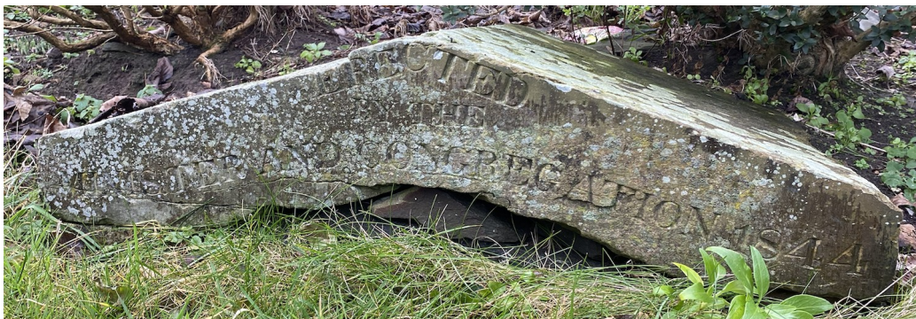
Keystone of Groomsport’s first school

Some history in the case of Groomsport’s first school, however, has happily been preserved for the keystone of the original school and of “Providence Place” that lay around the back of the church until all the restoration and extension work of 1970/71, and is now sited in a purposely made rock garden beside the church.